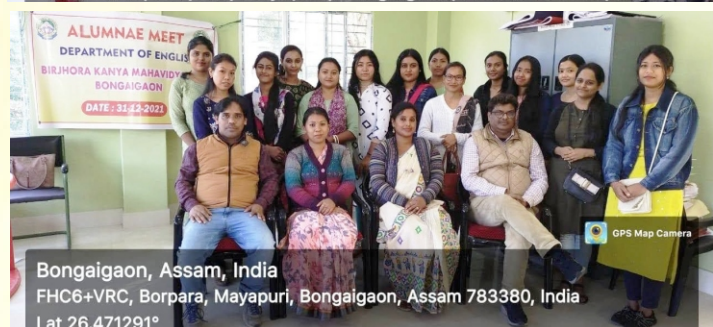
Bongaigaon, Assam, India FHC6+VRC, Borpara, Mayapuri, Bongaigaon, Assam 783380, India Lat 26.471291°