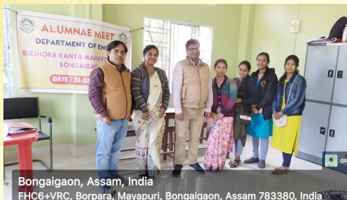
Bongaigaon, Assam, India FHC6+VRC, Borpara, Mayapuri, Bongaigaon, Assam 783380, India